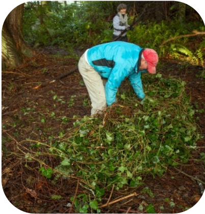
Ivy removal at a Land Trust Work Party.

As ivy creates dense patches it crowds out native vegetation. It can smother smaller plants as the vines grow over them, preventing sunlight from reaching the soil's surface. Consequently, native plant seeds are no longer able to germinate.