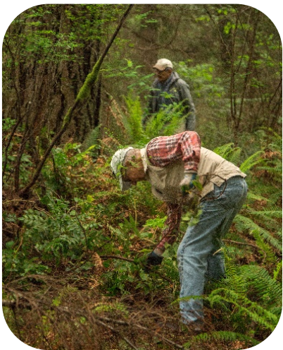
Ivy removal at a Land Trust Work Party.

As ivy creates dense patches it crowds out native vegetation. It can smother smaller plants as the vines grow over them, preventing sunlight from reaching the soil's surface. Consequently, native plant seeds are no longer able to germinate.