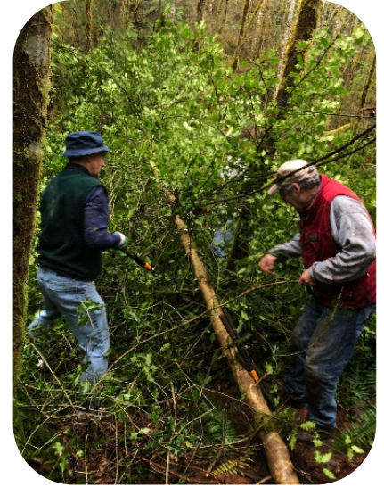
Volunteers remove a large holly during a Work Party.