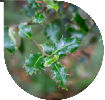
Invasive Holly.

This species can easily be confused with Oregon grape, so make sure you have correctly identified the invasive! For distinction between the two species, see the photos below.