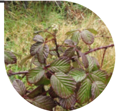
Himalayan blackberry © Forest and Kim Starr.

These shrubs are comprised of stout arching canes covered with large stiff thorns. The thickets are up to 15 feet tall with individual canes up to 40 feet in length. The canes originate from the blackberry root wad. Both species have palmate compound leaves usually in groups of five on main stems and canes are ridged. The easiest identifying characteristic between the two species are the leaves. Himalayan blackberry leaves are large, rounded to oblong with toothed leaflets. Despite its name, Himalayan blackberry does not originate from the Himalayas – it's actually from the Caucasus region in Eurasia!